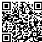
App Store iOS

Scan the QR for the App Store or Google Play Store to Download the App