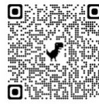
Google Play Store

Been Invited to a Group by a Coach, Club Sponsor, or Nurse and have an access code?