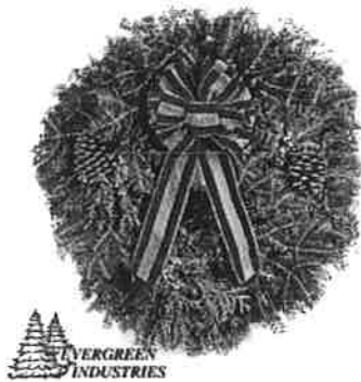
Lake Superior Wreath – $54.46