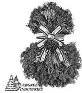
Voyageur Premier Swag – $49.93