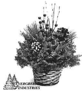
Evergreen Holiday Centerpiece – $51.30