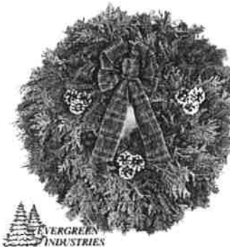
Itasca Premier Wreath – $54.46