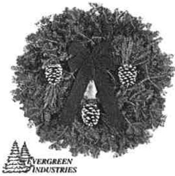
Decorated Balsam Fir Wreath – $49.91