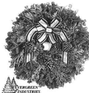
Voyageur Premier Wreath – $54.46