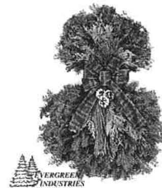
Itasca Premier Swag – $49.93

To place your order, go to https://my.evergreenindustries.com/friends-and-family/