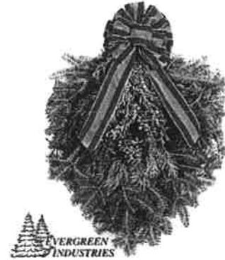
Lake Superior Premier Swag – $49.93