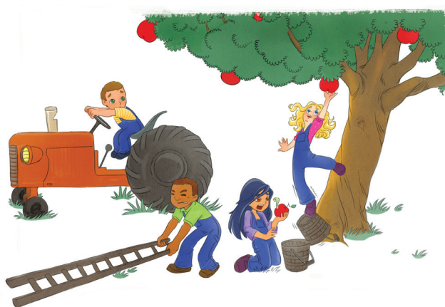
Group plan/own plan illustration.

In the story, the group plan was to pick apples. Evan followed his own plan and pretended to drive a tractor.