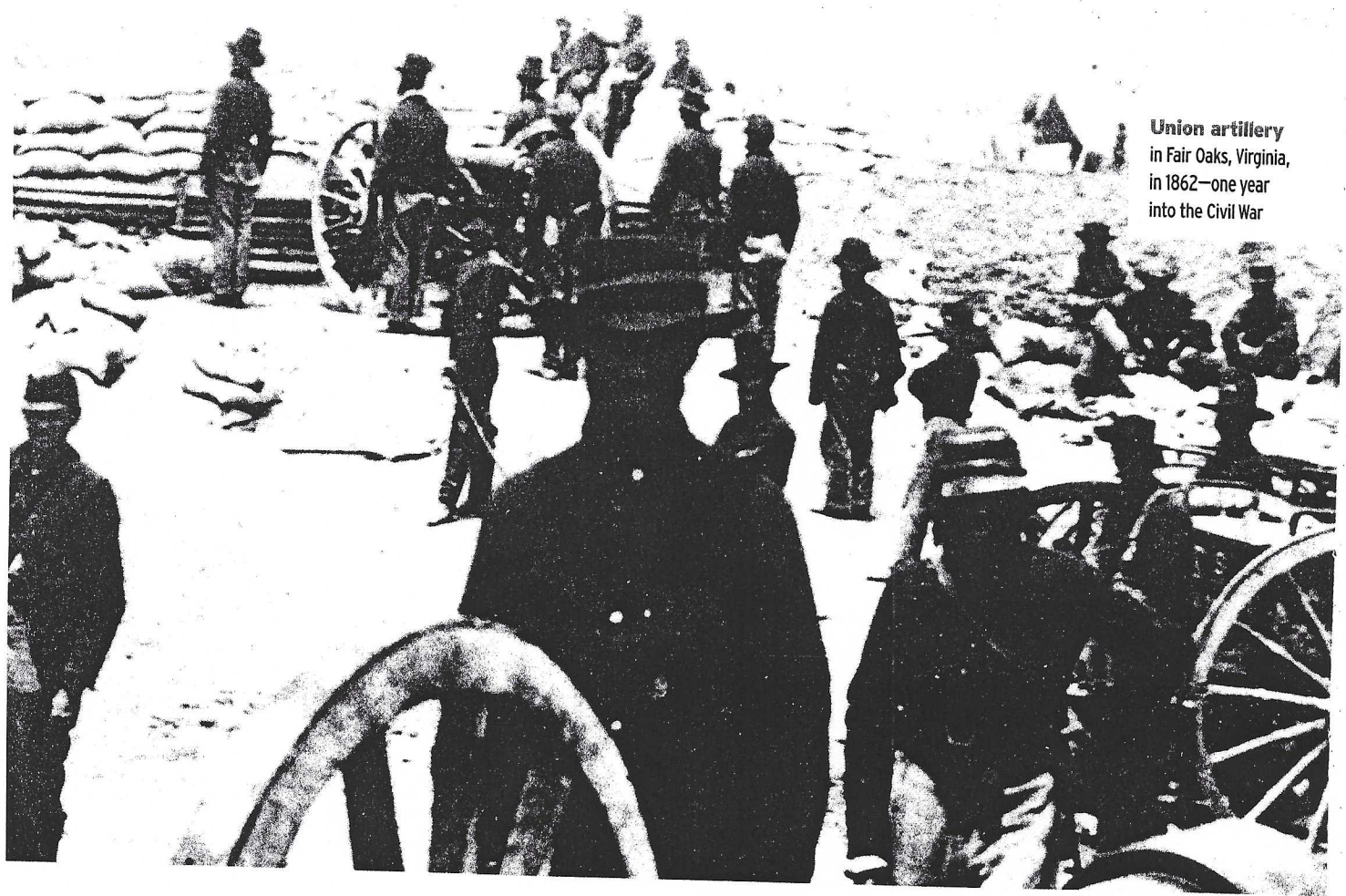
Union artillery in Fair Oaks, Virginia, in 1862—one year into the Civil War

life to a noble effort for human freedom.”