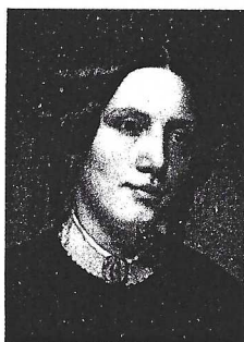
President Lincoln and Harriet Beecher Stowe, author of Uncle Tom's Cabin . He is said to have asked her, "Is this the little woman who made this great war?"

clear and doesn't really matter: At the time, many believed that Stowe and her book had in fact brought on the Civil War.