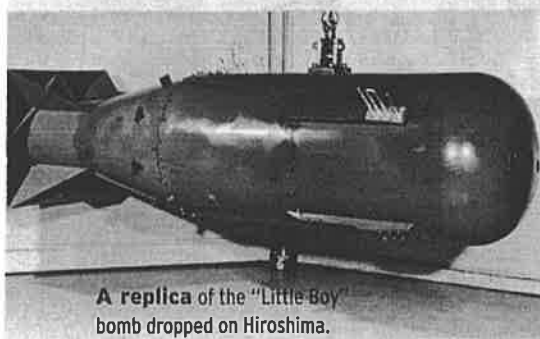
A replica of the "Little Boy" bomb dropped on Hiroshima.