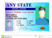
PHOTO ID FOR VISITORS

We will be selling Spirit Wear until October 1. All orders can be placed online using the QR code.