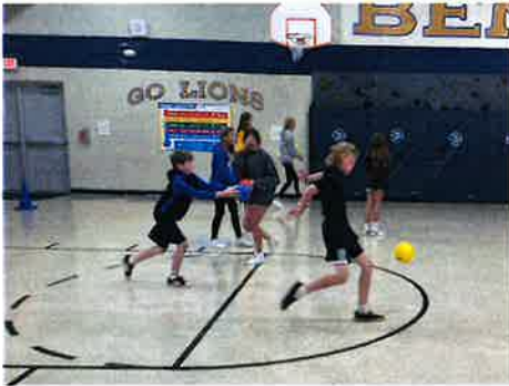
PUNTING - SOCCER