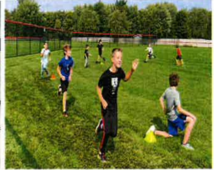
INDY 500 @ RUN CLUB