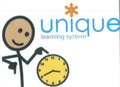
UNIQUE LEARNING SYSTEM

The Multi Needs Program utilizes technology to meet the needs of students and works closely with our SLP, SW, OT, and PT services based on each child's IEP.