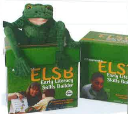
EARLY LITERACY SKILLS BUILDER